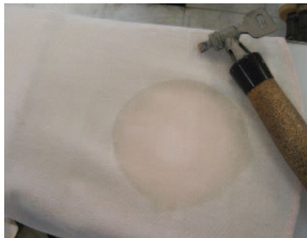
Redeposition can cause rings during stain removal.