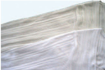
The sweater cleaned with the proper flow rate maintained its brightness. The sweater cleaned with an inadequate flow rate has irreversible graying.

Redeposition in some cases can be permanent, no amount of recleaning will remove it. In some cases, removal on the spotting board is possible. One way of checking is to place the garment on the board and drop a little pure solvent on the garment if a ring appears as the solvents spreads outwards it is more likely to be redeposition.