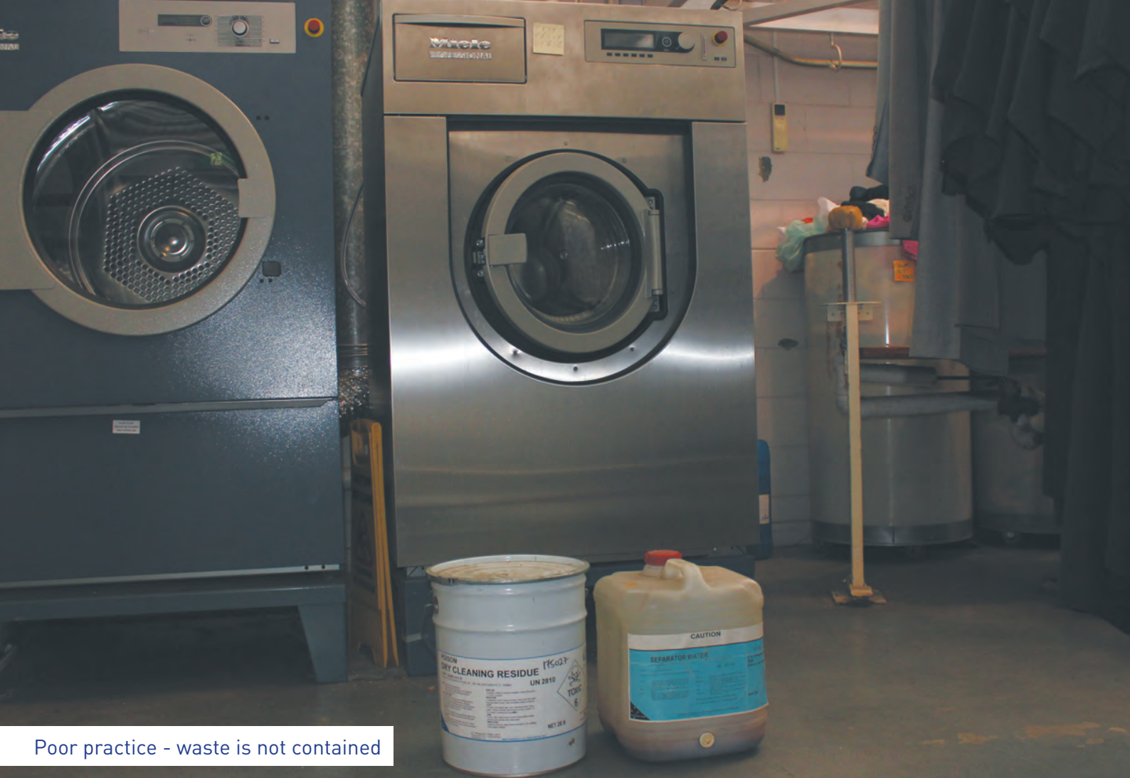
Poor practice - waste is not contained