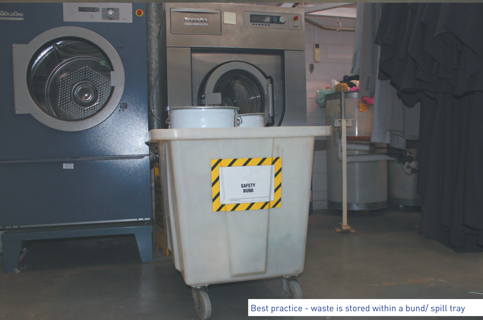
Best practice - waste is stored within a bund/ spill tray