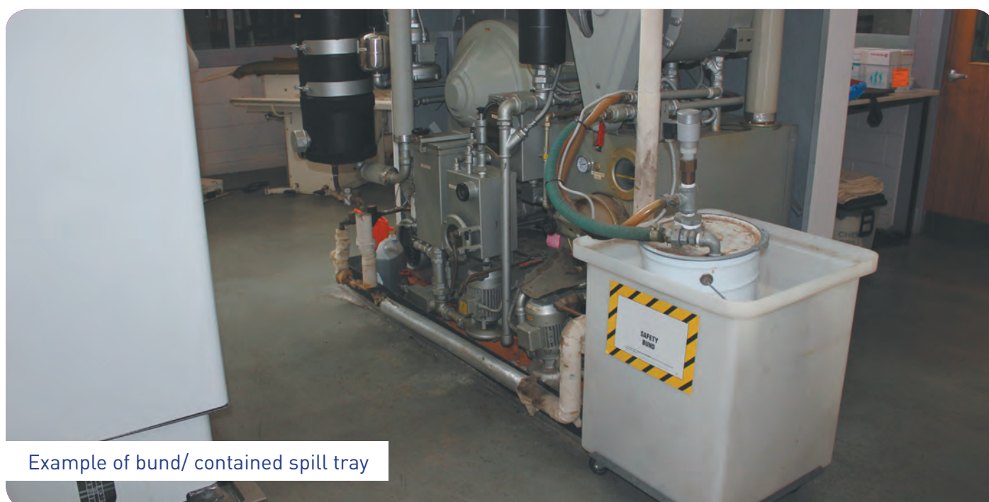
Example of bund/ contained spill tray